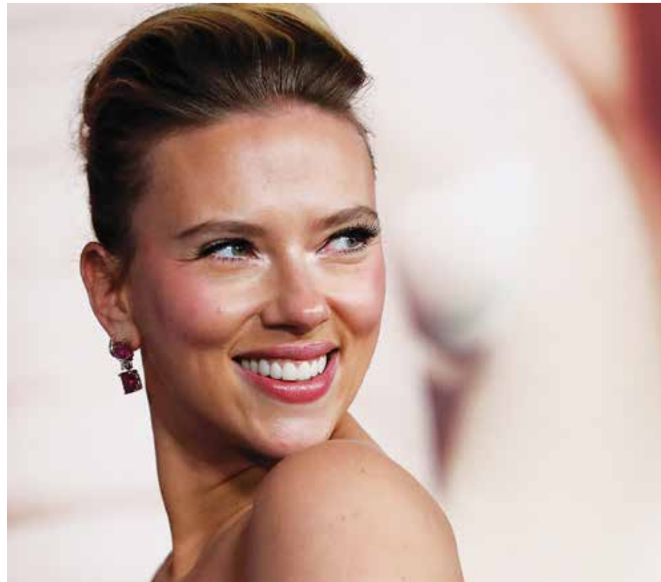
Scarlett Johansson refused to give in to BDS pressure.